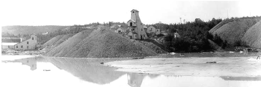
Fig. 3: Typical waste rock disposal practices in the early silver mines of Cobalt (photo credit: Canada Museum of Science and Technology).

There are also concerns that some of the mill foundations and nearby soils, including those at some sites on the Heritage Silver Trail, are contaminated with As and various metals and may pose a risk to those visiting the sites (Pagliarulo and Manca, 2005). The Heritage Silver Trail is a self-guided driving tour of several mine and mill sites in the area.