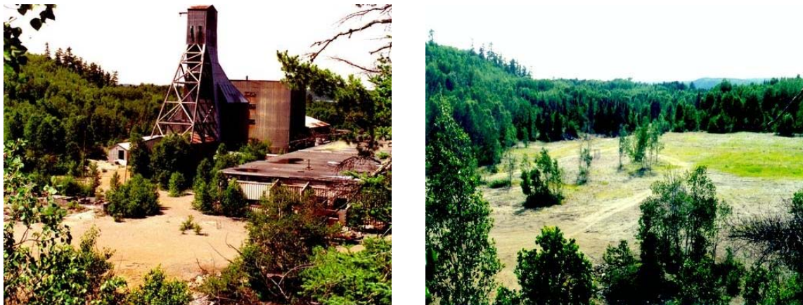
Fig. 1: The North Coldstream Mine near Burchell Lake in Ontario. Taken in 1993 (left) and 2001 (right), the photos illustrate the extent of mine reclamation work carried out on the site by the Ontario Ministry of Northern Development and Mines.

While removal of buildings is not required in Ontario, mine closure at most sites does include the removal of buildings. For example, the headframe and other buildings of the North Coldstream Mine were removed and the site was revegetated (Fig. 1) under the Abandoned Mines Rehabilitation Program of the Ontario Ministry of Northern Development and Mines. At most sites this approach is not a concern, and makes the most sense in the context of the objectives of mine closure. However, this practice becomes problematic when these structures are also heritage resources.