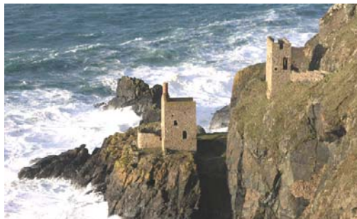
Fig. 5: Engine house of the Botallack Mine.

The Botallack labyrinth is a site particularly relevant to some of the mill sites around Cobalt. Mining at the Botallack site dates back to the early 1700s (The Trevithick Society, 2007), and the site, as well as the Levant Mine a few kilometers to the north, host some of the most spectacular historic mine sites anywhere in the world. The mine workings extended under the Atlantic Ocean and the mines were located along cliffs along the shoreline. (Fig. 5). This spectacular location has made the site popular with tourists for decades.