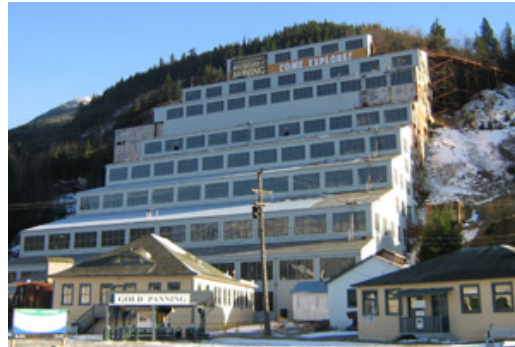
Fig. 7: The Britannia Mill before and after restoration