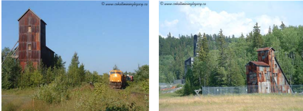
Fig. 2: Cobalt mine headframes, both now almost 100 years old.